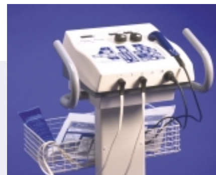
The model 93 or 94 cart offers a sturdy treatment platform for heavy clinical use.