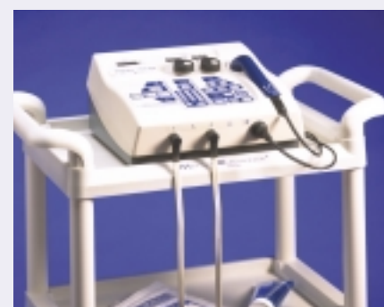
The economical model 73 cart includes 3 shelves to accommodate Mettler units and accessories.

The value-priced Sonicator Plus 930 combines a wealth of important features for the busy practice. Therapeutic ultrasound is provided by a 1- and 3-MHz, 5 cm 2 applicator with unique direct crystal-to-patient contact. And muscle stimulation is delivered in a choice of three waveforms—Interferential, Premodulated, and Medium Frequency (Russian stimulation).